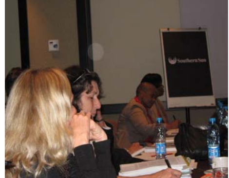
Was it something I wore? Workshop