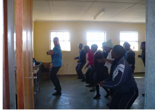
Three Norwegian Students at Vulindlela