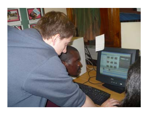
Technical training in editing of documentary film