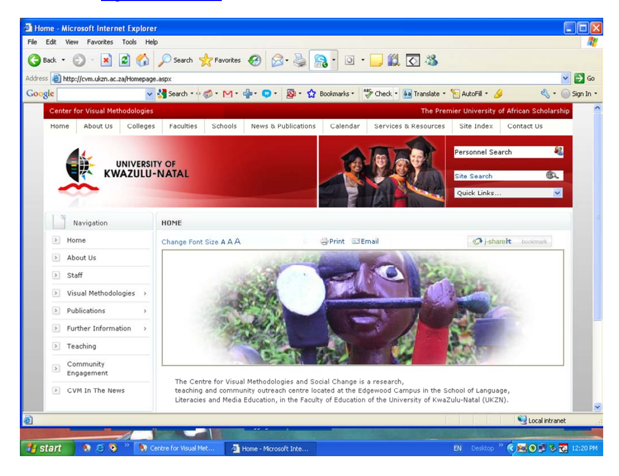
The new look of the CVMSC Website