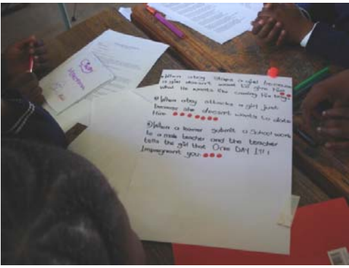
Learners at Kuhlekonke Senior Secondary School engaged in video documentary work around gender-based violence